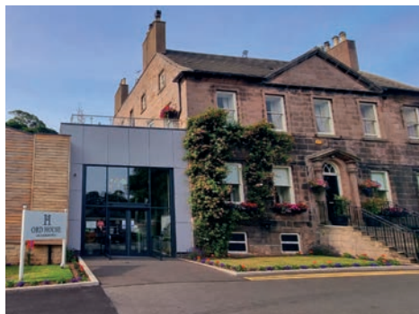
East Ord, Berwick-upon-Tweed, Northumberland TD15 2NS