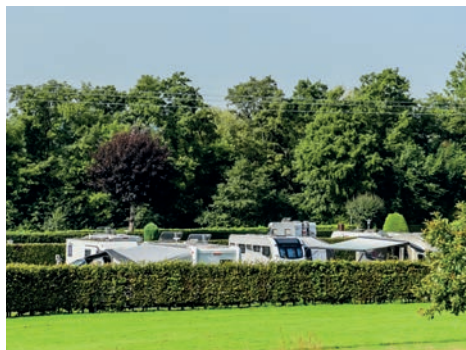
Peterchurch, Golden Valley, Hereford HR2 0SF