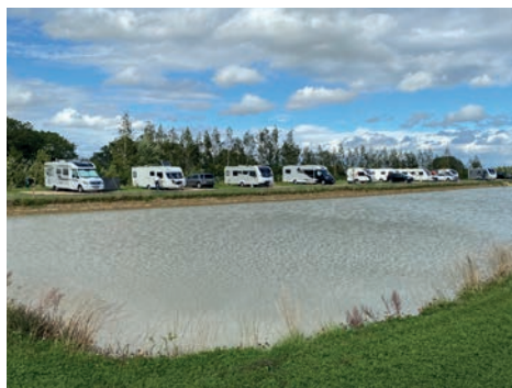
Stretton, Oakham, Rutland LE15 7QS