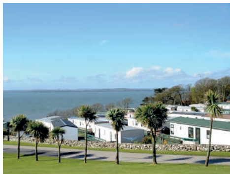
Gatehouse of Fleet, Castle Douglas DG7 2EX